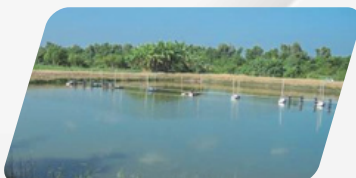
Fish pond drainage and irrigation